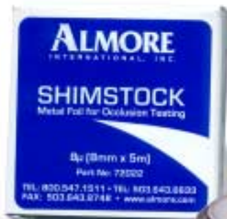
72022 SHIMSTOCK ROLL