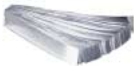
72070 SHIMSTOCK STRIPS